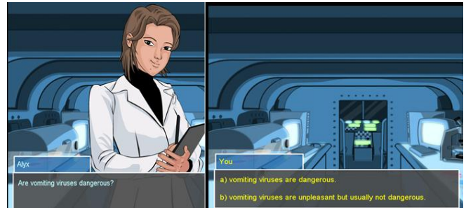
Figure 3. Example of an evaluation question integrated in the game

During the investigation, Alyx is always ready to help the player, asking questions related to the investigation and assisting with evidence that was collected. Although totally integrated into the game flow, the questions assess the educational content presented (Figure 3). The questions are spread throughout the game, and asked so that they will fit in the context of the game. However, these questions are asked before the player is exposed to game mechanics through which s/he can learn about the objectives being asked. The questions are asked in an abstract manner, in order to see whether the player understands the scientific concept, and if