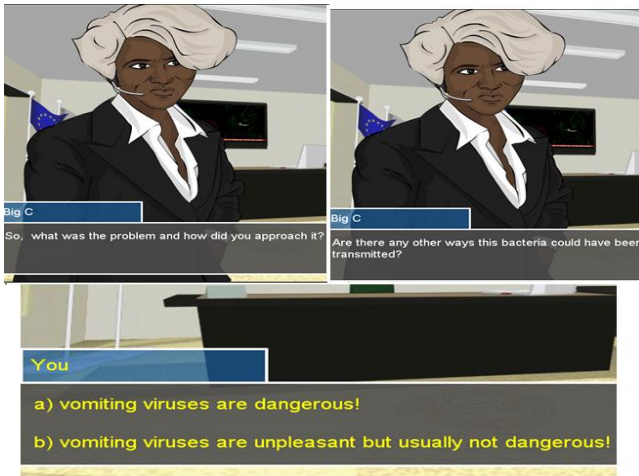
Figure 4. Example of a question at the end of the game, during the debriefing

what s/he learns is generalised. We do so because a previous study has shown that some of the skills learned through games are not necessarily broad and general, and the player is able to use the skills in the same environment but has problems translating them in a real-world environment [1]. However, the LOs are delivered both in an abstract manner as well as through the game mechanics. If the player gets an answer wrong, the correct answer is given to the player immediately after the player gives her/his answers, in order to correct misconceptions and allow the player to improve its knowledge during the game play.